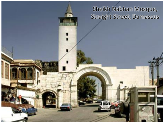
Sheikh Nabhan Mosque, Straight Street, Damascus